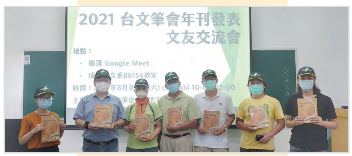
會後理事長 kap 參加現場 ê 會員合影